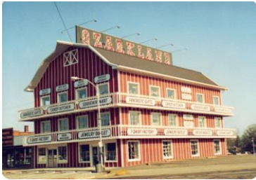
Ozarkland Camdenton, MO